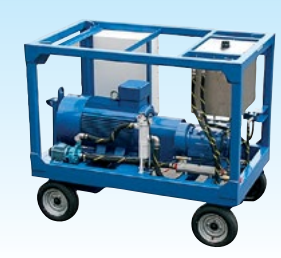
HPS5000 EC (electric crashframe trailer)